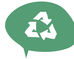
RENEWABLE ENERGY SOURCES